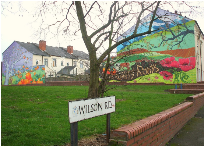
Wilson Road—site of the first recorded Aston Villa game and home to the WELD photography project.