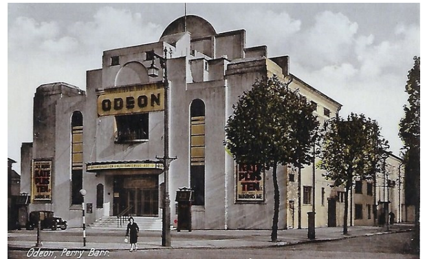
First Odeon Cinema—Birchfield Road