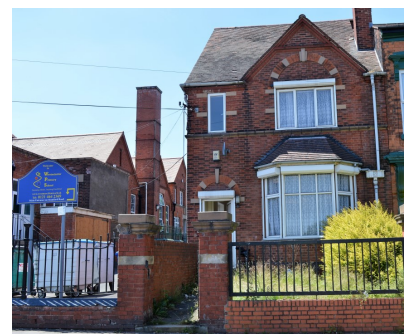
Illustration of the Community Hub

If you would like more information please contact Andrew on 0121 448 5594 (Mobile: 07421 994752).