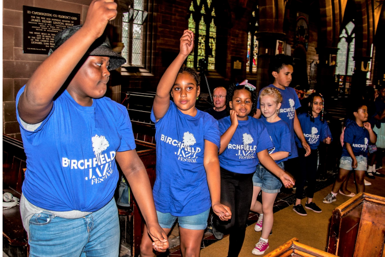
Performing at the Birchfield Jazz Festival in St Mary's Church

As part of this long-term project, BBL will be seeking to create a new mural which reflects the passions and history of this diverse community, which will celebrate and make a lasting impact on the social environment of the area and enhance the secret garden space