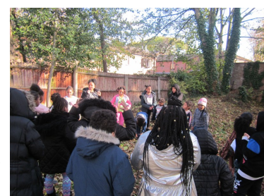
Some photos from the Autumn half-term scheme.

If you want to be part of this project, please contact Russell Green at Birchfield Big Local - russell@birchfieldbiglocal.org Mobile: 07419 213430