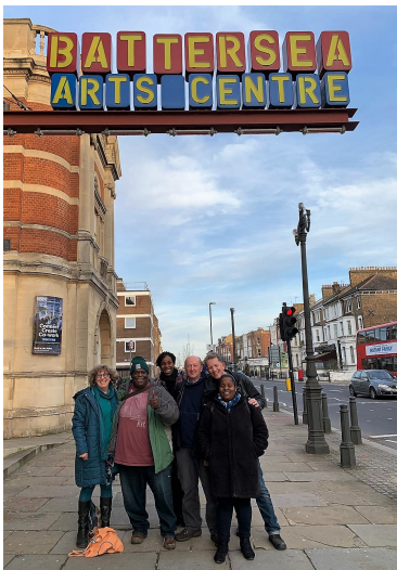
Visiting Battersea Arts Centre for a Creative Civic Change Learning Event

Together with Welsh House Farm Big Local we are one of sixteen areas selected to take part in the Creative Civic Change project. The project aims to support communities in using arts and creativity to make a positive change in their areas.