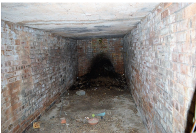
Inside the WW2 bunker at Grosvenor Road Studios

While at Grosvenor Road Studios for the 'Our Feast' project I was able to go into the World War 2 bunker that is in the garden there.